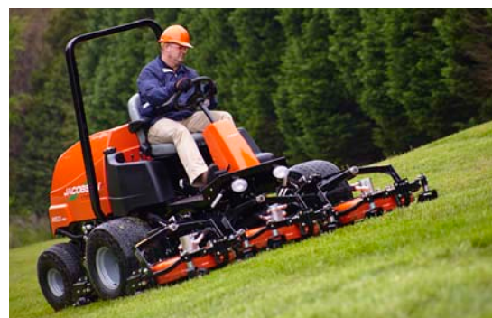
AR522 with SureTrac 4WD

*Engine horsepower is provided by engine manufacturer. Actual operating power output may vary due to conditions of specific use.